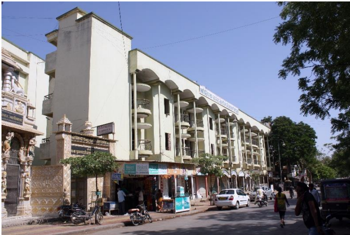
Entrance to Nitya Chandra Darshan