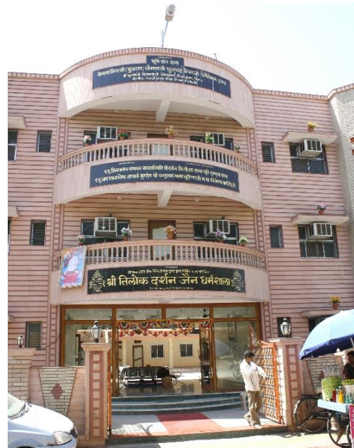
Entrance to Tri Lok Darshan