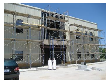
New Building of JVB HOUSTON

JVB Houston started a course on "Understanding Jainism". The first "Understanding Jainism" class was a simple introduction to understanding some of the concepts of the vast and complex tradition. People from different faiths joined and tried to understand Jainism. The session was very successful and the Samanijis clarified questions raised by the audience.