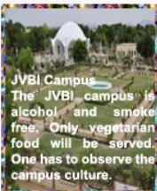
JVBI Campus The JVBI campus is alcohol and smoke free. Only vegetarian food will be served. One has to observe the campus culture.

A study tour of one week covering Jaipur, Pushkar, Ajmer, Jodhpur, Nakoda, Osiyaji, Bikaner etc. will be organized for the participants. Fee $250/- per student. Date and other details are available with co-ordinator.