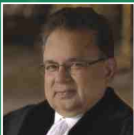
Padma Bhushan Justice Dalveer Bhandari Member, International Court of Justice