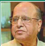
Padma Vibhushan Dr. K. Kasturirangan Former Chairman ISRO