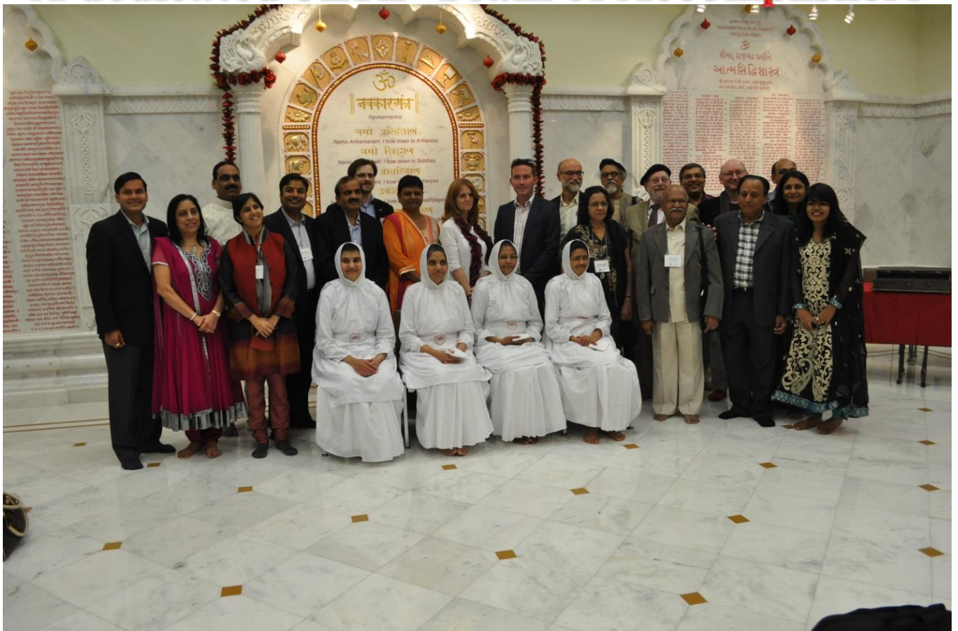
A Scholars Team of Presenters