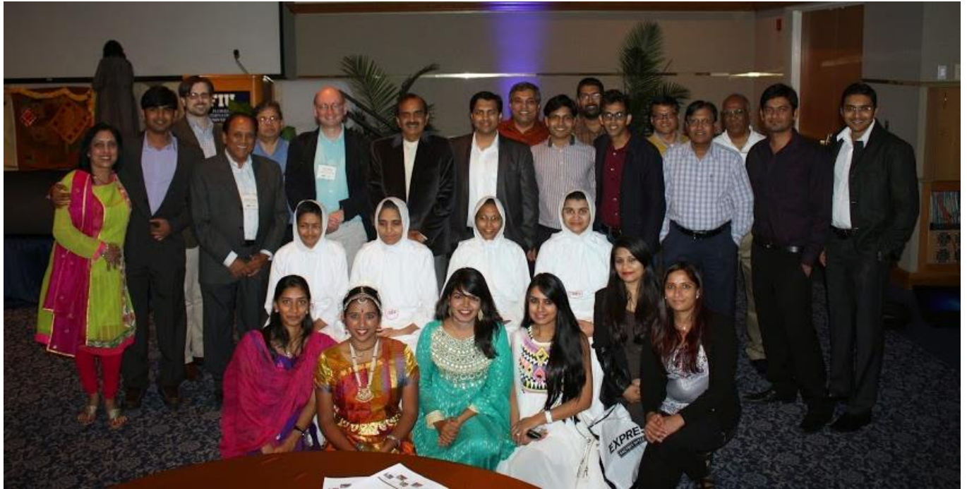
A dedicated JERF Team of Accomplishers