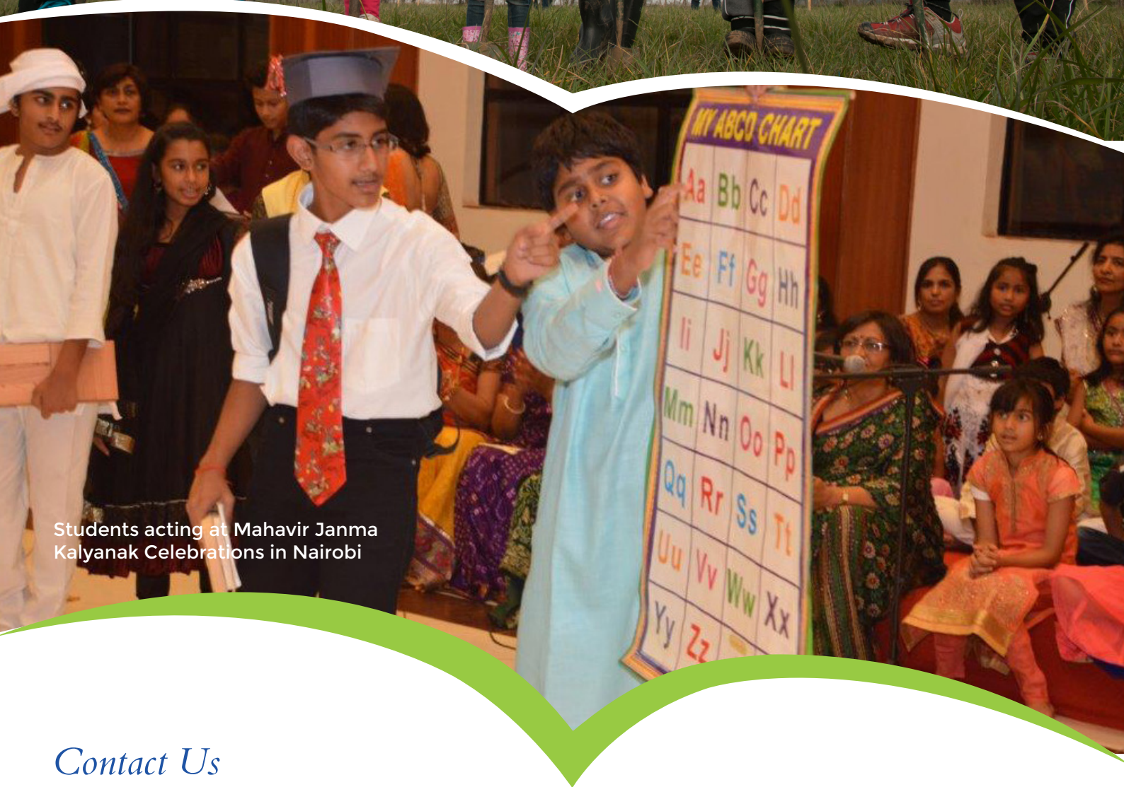
Students acting at Mahavir Janma Kalyanak Celebrations in Nairobi