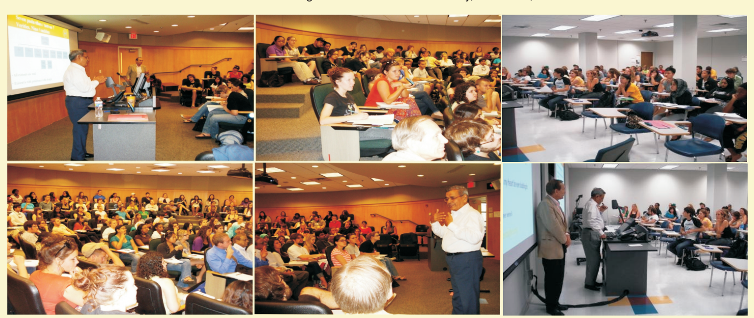
Das Lakshan Poojas and lectures at Jain Centre of Greater Boston from 2nd to 12th Sep 2011