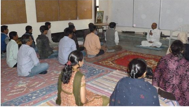
Meditation Camp at Shrujan Institute at Kutch