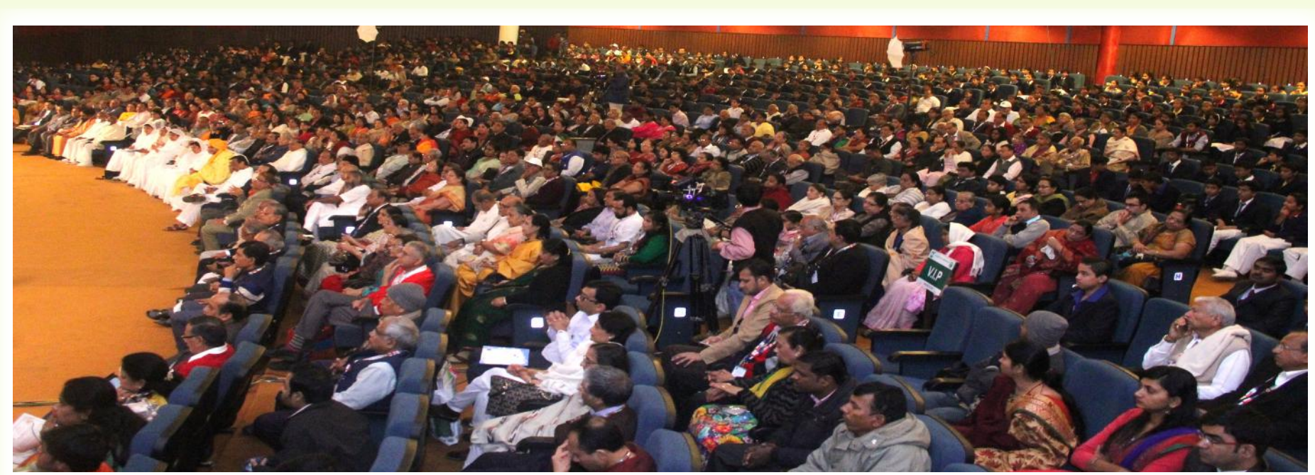
Delegates from many countries attended the conference, held in a state of the art conference center in Rajgir.

These two messages truly encapsulate the thought that underpins the Veerayatan ethos of Compassion in Action.