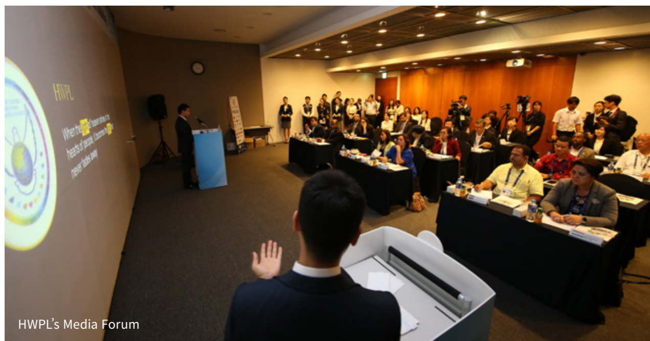
HWPL's Media Forum

HWPL is actively working towards the goal of holding the media accountable for accurate reporting standards. The Media Forum was attended by 19 journalists and reporters from 17 major international press outlets. It provided an opportunity for them to explore peace campaigns and projects that HWPL has initiated in order to motivate the whole world through publicizing various media productions. HWPL's Publicity Ambassadors that consist of international reporters, editors, and producers are the eyes of all people, allowing the world to see, hear, and react through their coverage.