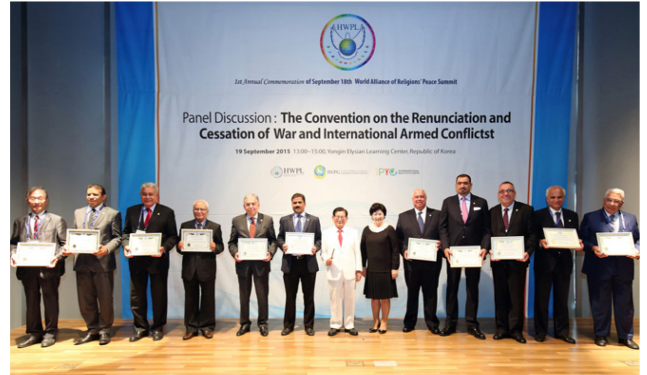
The HWPL International Law Peace Committee