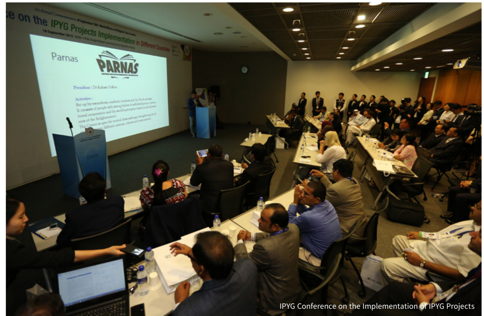
IPYG Conference on the Implementation of IPYG Projects

All youth participants of the IPYG Conference who have dedicated their youth to promote peace were able to reaffirm that they are the future of a world of peace. By introducing four main peace projects, the IPYG Peace Walk Festival, the 525 HiFive project, the Peace Zone Project, and the Global Signature Campaign, IPYG inspired all attendees to start creating a culture of peace amongst the youth of the world. Speakers also shared about their experiences working with IPYG and reminded all youth of their critical role in peace-building and the processes of the implementation of the convention on the cessation of war.