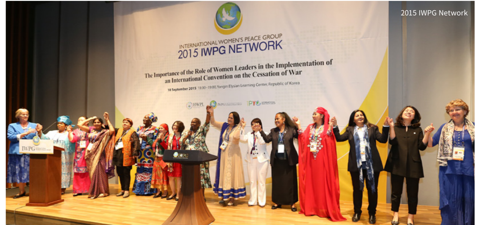
2015 IWPG Network

2015 IWPG Network: the Importance of the Role of Women Leaders in the Implementation of an International Convention on the Cessation of War was attended by over 60 women leaders from 25 countries. The participants included Ministers, First Ladies, Queens, Princesses, and Peace Group Leaders. They discussed the significant role that all women have in urging the international community to implement such a convention. The speakers underlined the importance of establishing a women's peace network on a worldwide basis.